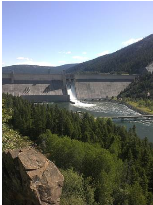
Libby Dam Libby, Montana

Bonneville Power Administration U.S. Bureau of Reclamation U.S. Army Corps of Engineers